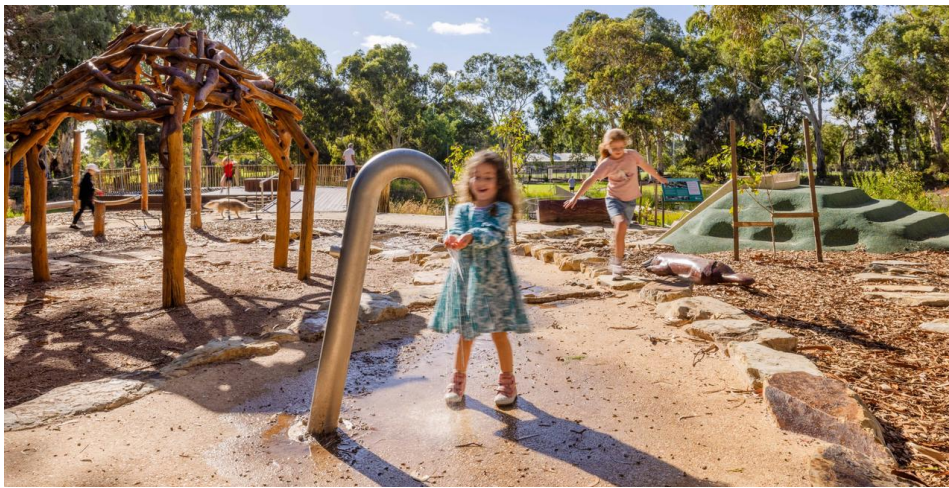
The Kensington Wama / Kensington Gardens Reserve.