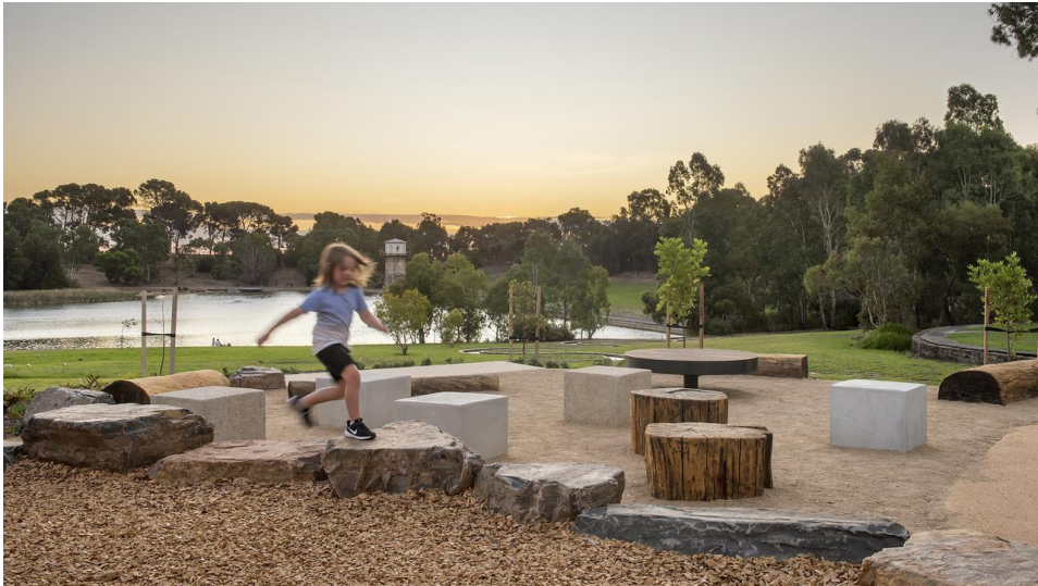
Thorndon Park playground.

What the jury said: “Thorndon Park Playground provides the City of Campbelltown with an iconic all-ages destination play space. The playground stays true to its goal of creating ‘something for everyone’ whilst delivering an engaging and iconic playscape for the Adelaide suburbs.”