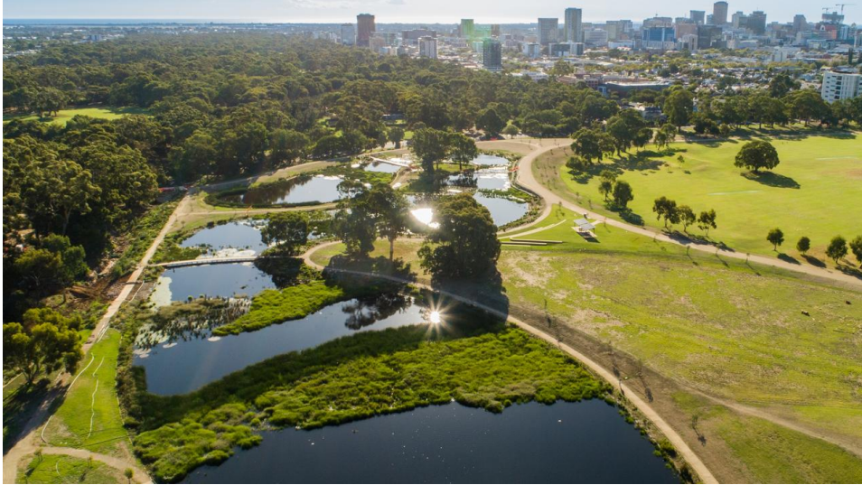
The South Parklands Wetland.

project which is an exemplar for green infrastructure, and the enhancement of natural ecosystems in the city.”