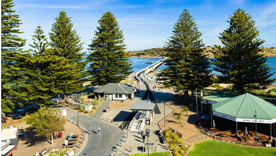
The Granite Island causeway was a major winner at this year's Australian Institute of Landscape Architects SA awards.