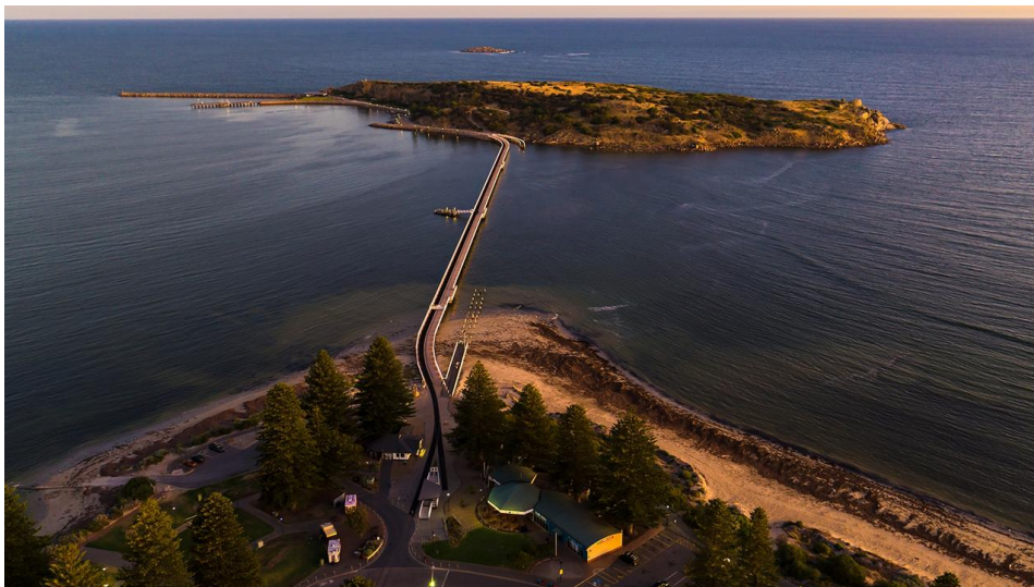
The new Granite Island causeway opened in 2021.

What the jury said: “An outstanding example of meaningful, genuine engagement of First Nations. Celebrating the cultural heritage of the Ngarrindjeri and Ramindjeri peoples, it brings to life their dreaming stories, and reveals the natural history of the site. It bridges the divide between the past and present. An ever-popular tourist destination, in its historic coastal setting, this is a once in a lifetime project that seamlessly integrates the history and honours the memories of the precinct, leaving an enduring mark for future generations.”